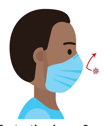
Protection Layer 2: Germs & droplets blocked

In our centers, everyone has to wear surgical masks to reduce the spread of COVID-19. This gives two levels of protection.