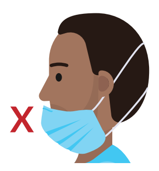
Don't expose your nose!

Let's help protect each other by noticing when we see improper mask wear.