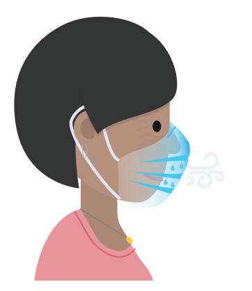
Protection Layer 1: Droplets captured in the mask